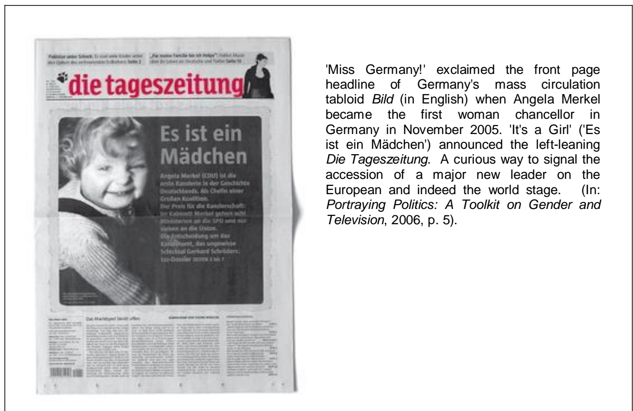
'Miss Germany!' exclaimed the front page headline of Germany's mass circulation tabloid Bild (in English) when Angela Merkel became the first woman chancellor in Germany in November 2005. 'It's a Girl' ('Es ist ein Mädchen') announced the left-leaning Die Tageszeitung . A curious way to signal the accession of a major new leader on the European and indeed the world stage. (In: Portraying Politics: A Toolkit on Gender and Television , 2006, p. 5).

Half a century ago, in the wake of second wave feminism, it made sense to publish 'the first woman to ...' articles and documentaries. Pioneer doctors, pilots, ministers turned out to have been there for longer than stereotypical images allowed. Since then, it makes less and less sense to comment on the fact that it is a woman who is taking up a particular profession, function or achieving spectacular results.